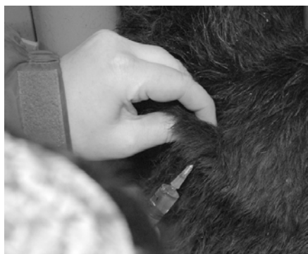
Figure 1. "Tenting" method

Intravenous, subcutaneous, intramammary, intramuscular, intraruminal and intraperitoneal are injections. Most injections are given either intramuscular (into a muscle) or subcutaneous (under the skin). The label will provide an acceptable route of administration. In some cases, the label may specify more than one route of administration. When the label calls for either subcutaneous or