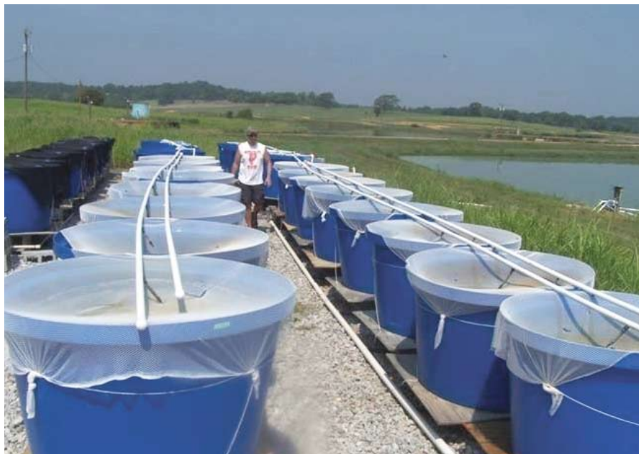
Trial results are leading local shrimp farmers to consider alternatives to fishmeal in feed.