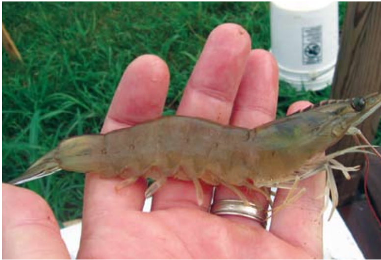
Shrimp that received feed with alternatives to fishmeal grew to sizes similar to those fed fishmeal-based diets.

across all the treatments (Figure 1). Although survival ranged 91-98%, the differences among diet treatments were not statistically significant.