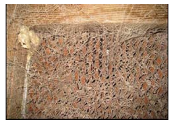
Insects, dust, dirt, and dander can quickly clog evaporative cooling pads during summer months. Keeping the pads clean greatly improves airflow and bird cooling.

When it is time to service the cooling system use only pad manufacturer approved cleaners and algaecides in the system and on pads.