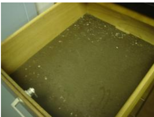
American cockroach droppings in drawer.