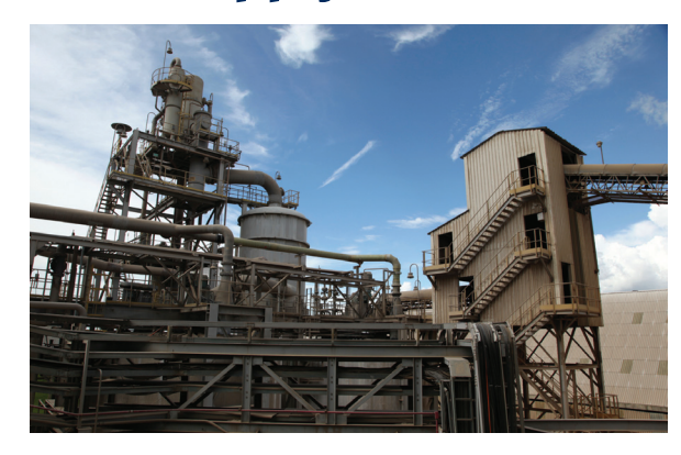
A NEW KIND OF DEPENDENCE?—The U.S. will deplete its phosphate rock reserves within 30 years, thus becoming dependent on foreign countries for phosphorus fertilizers that are essential to food production.

Of those three corporate giants, one is a monopoly authorized by the Moroccan government. The other two have a cartel sanctioned by the U.S. under the 1918 Webb-Pomerene Act, which basically gives them antitrust immunity to set prices above competitive levels. They also have an export cartel sanctioned by the Canadian government. As is true with most cartels and monopolies, these three companies can jack up phosphorus fertilizer prices at will, Taylor says.