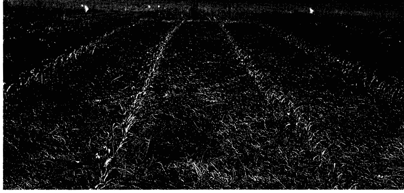
UNIVERSITY OF KENTUCKY • COLLEGE OF AGRICULTURE • LEXINGTON, KENTUCKY Southern Region Series Bulletin 319