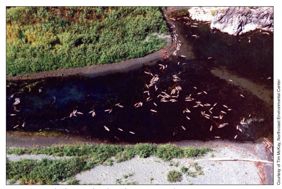
Figure 1. Dead salmon in the Klamath River, September 2002.

asked to project the ecological responses to dam removal in the US (Hart et al. 2002), or in Australia's Murray-Darling River Basin, to advise on how to "press dams into environmental service", to provide so-called "environmental flows" (D Blackmore, pers comm). However, the calculus of environmental, economic, and social costs and benefits in many of these restoration efforts is complex, and scientific uncertainty further complicates matters (Pigram 2000; Bunn and Arthington 2002; Stanley and Doyle 2003).